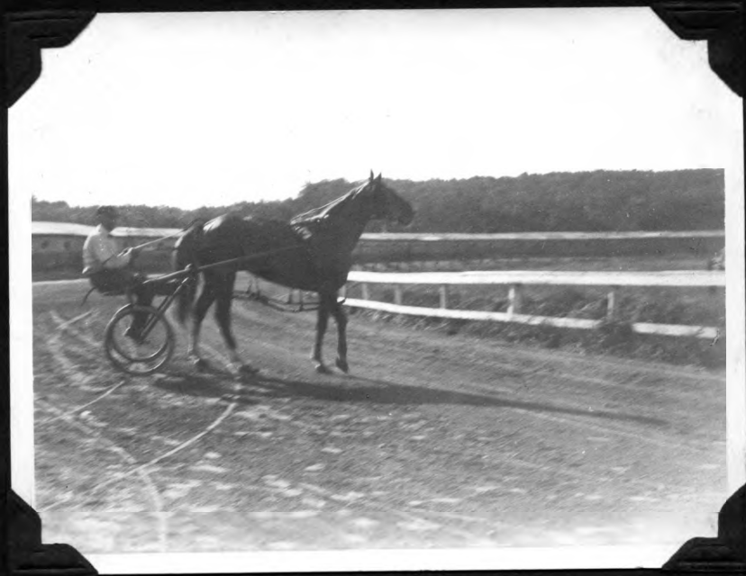
— Ruby B —