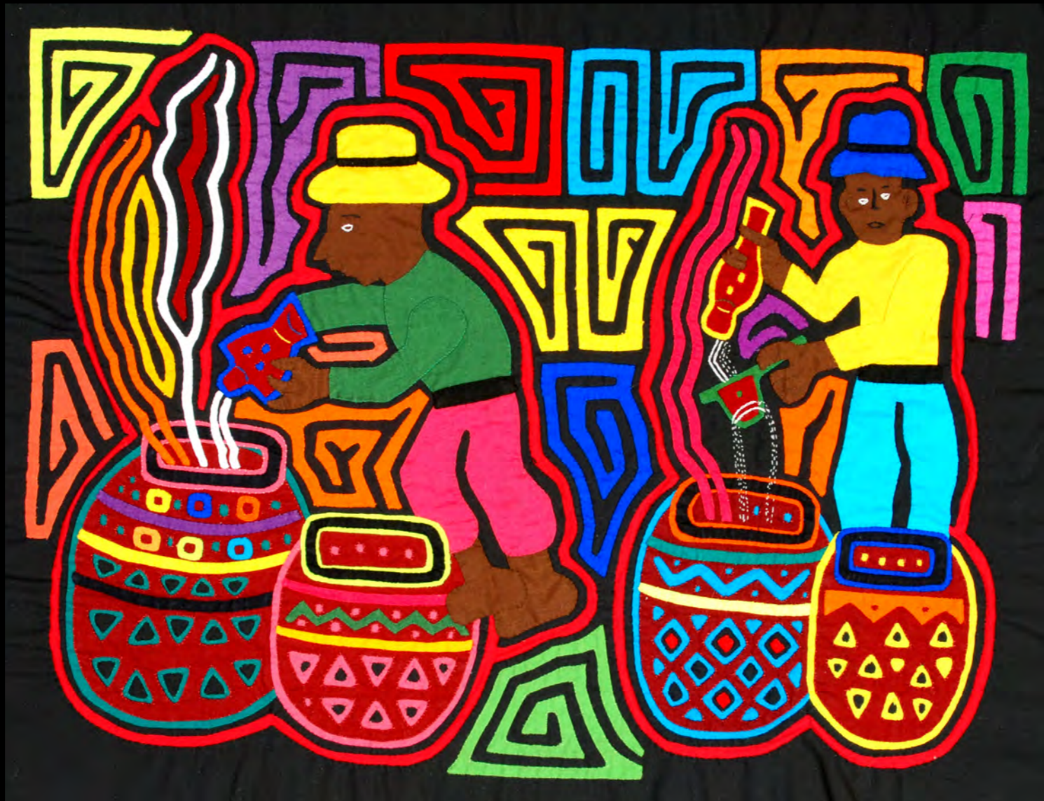
Chicha making Ailigandi

Chicha is made from fermented corn and sugar cane juice. This mola shows the evolution of mola work from the more difficult reverse appliqué technique to easier appliqué work. This style is made for the tourist trade and the panel was not intended to be used in a blouse.