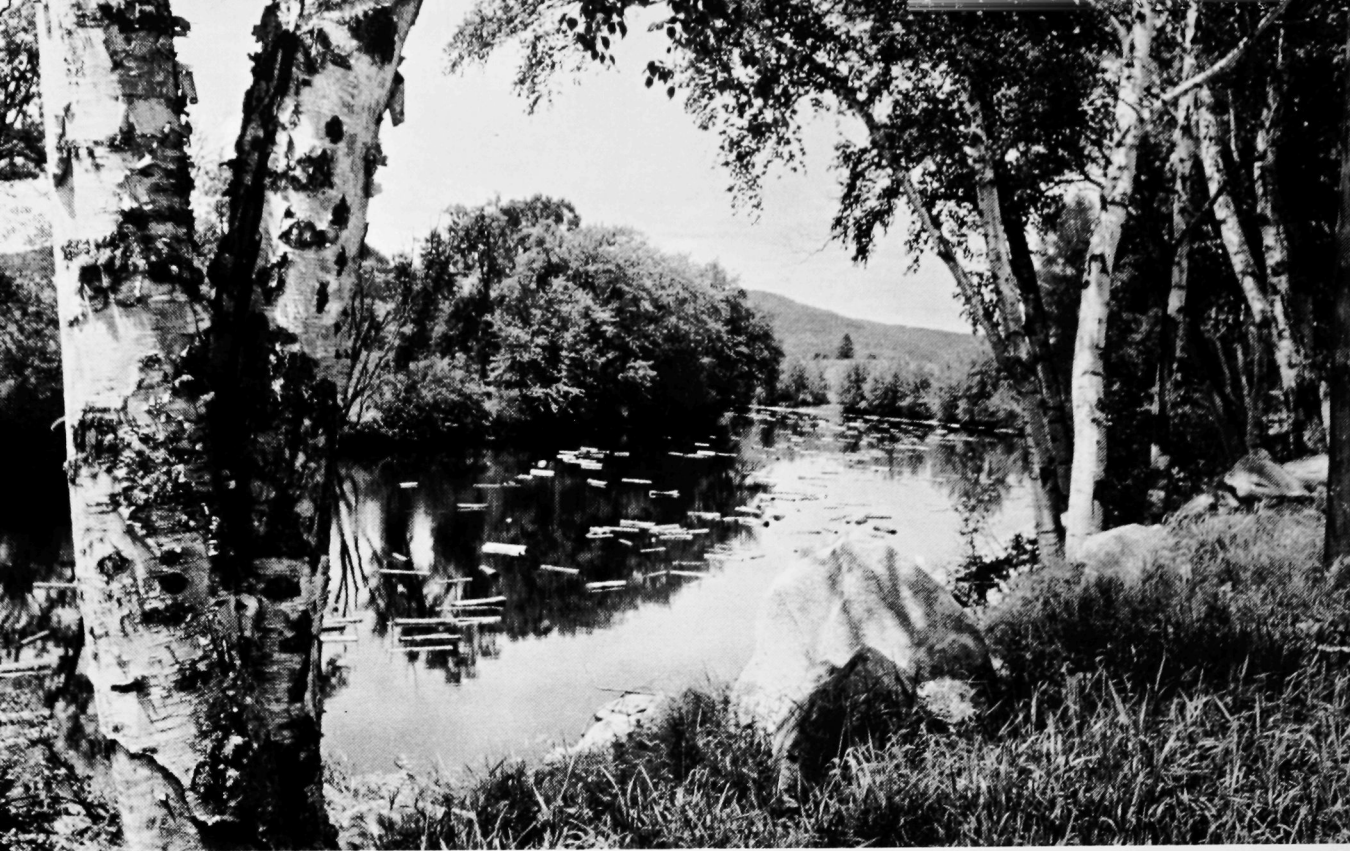
From the Press of Furbush-Roberts Printing Co., Bangor