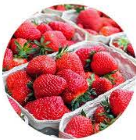
Guidance for Pick-Your-Own Operations from Maine DACF and UMaine Extension

Here is where you will find helpful guidance and support in setting up your U-pick operation this year amidst the COVID-19 outbreak.