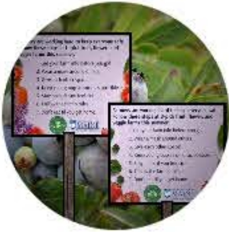
Guidance for Consumers visiting Pick-Your-Own Operations from UMaine Extension and Maine DACF