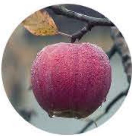
Cornell's pdf version of COVID-19 BMPs for U-pick Farms