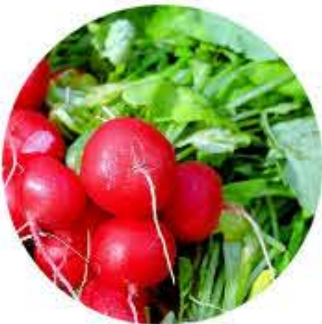
Maine Farm Vendor Practices during COVID-19 (webinar from Maine Federation of Farmers' Markets)