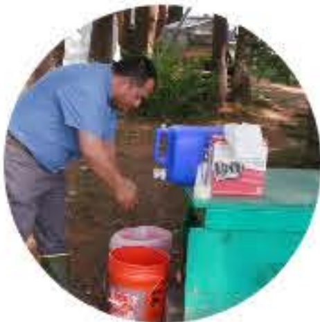
Video: Safe Handwashing on the Farm (pre-COVID-19 but even more relevant today!)