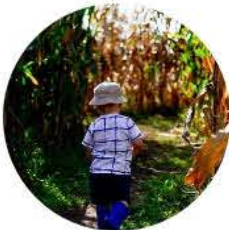
Agritourism Safety Resources List