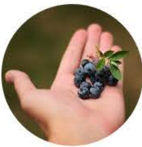
Cornell (web version): COVID-19 BMPs for U-pick Farms