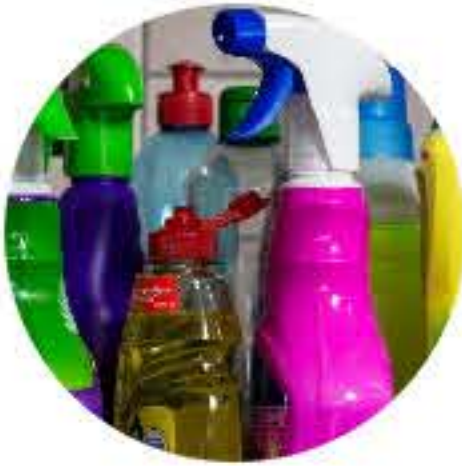
Maine-Registered Disinfectants for Use Against COVID-19