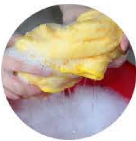
Cleaning vs. Sanitizing (Produce Safety Alliance)