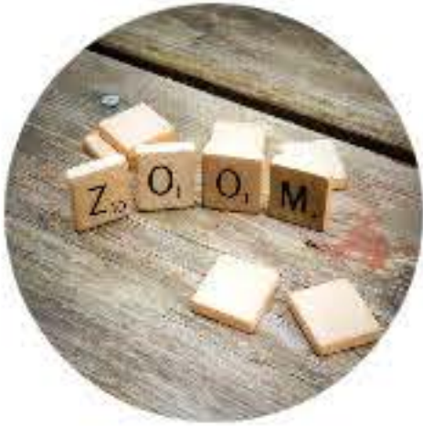
May 12, 2020 Zoom Discussion on Best Management Practices for U-pick Operations During COVID-19 (YouTube)