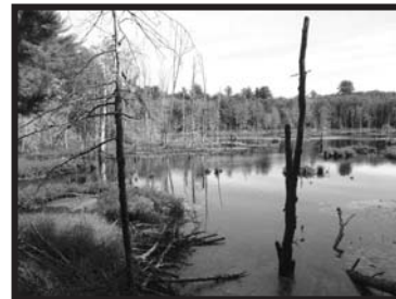
Beaver wetlands at Orris Falls Conservation Area September 2016