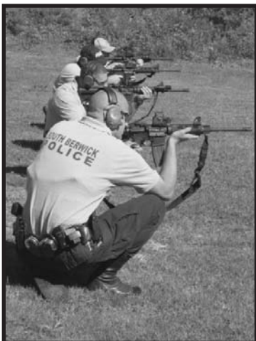
Training Day at the Firing Range

Their efforts improve the lives of everyone who lives in our great community.