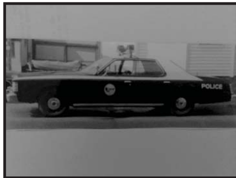
New Cruiser 1973