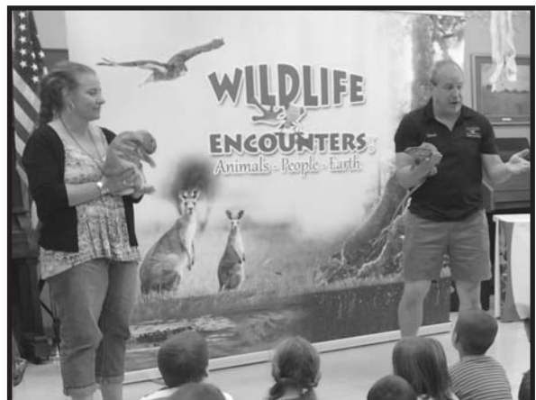
Wildlife Encounters at the Community Building