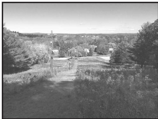
View from top of Powderhouse Hill Ski Area