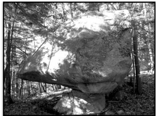
Balancing Rock