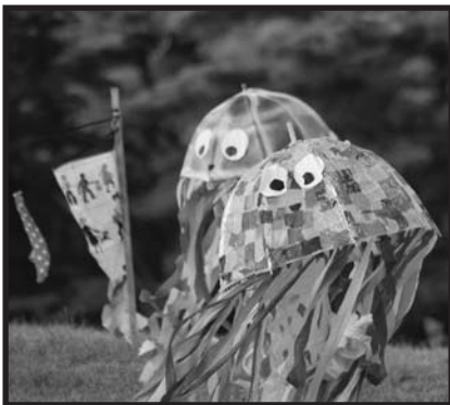
Lantern Fest