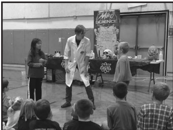
Mad Science Program at Central School