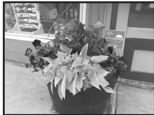
Salmon Falls Garden Planter on Main Street donated by SoBo Central