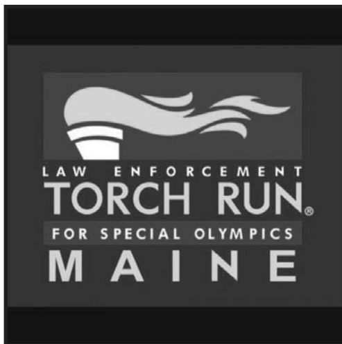
Special Olympic Torch Run