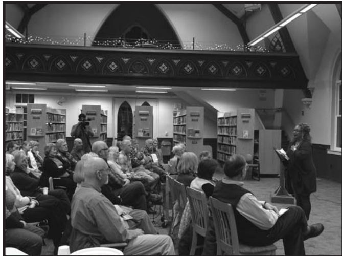
History Program on Portsmouth NH African Burial Ground