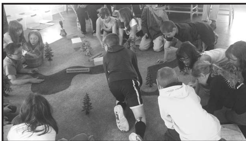
Journeys Program at Counting House