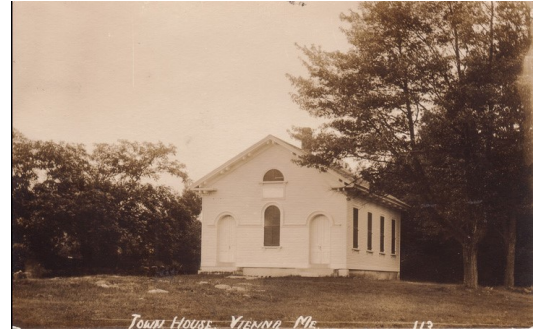
Vienna Town House