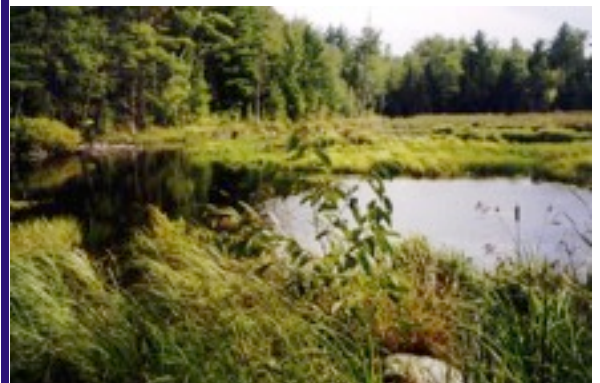
The Small Woodland Owners Association of Maine's Ladd Forest property in Vienna

Email: gilmans2@fairpoint.net web: barbshandpainted.craftah.com