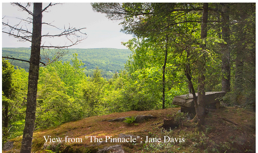
View from "The Pinnacle"; Jane Davis

Vienna Woods Conservation Area: encompasses 71 acres of fields, woods, and streams that are now protected by a conservation easement. Straddling a prominent ridge line in Vienna the property provides scenic views of the Kennebec Highlands and Flying Pond to the east. Trask Road, Vienna.