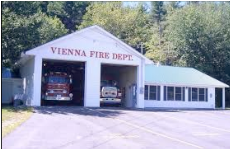
Fire Department/Community Center - Get ready for winter - have your chimney cleaned! Sign up at F.P.Variety.