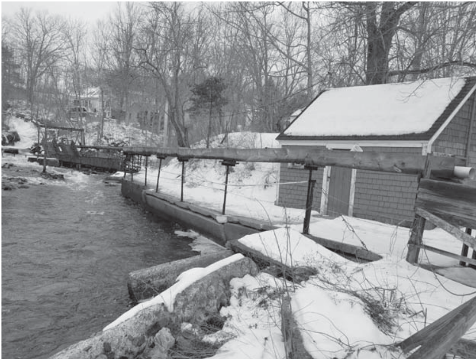
The rebuilt wooden trough that aids in harvesting the alewives.