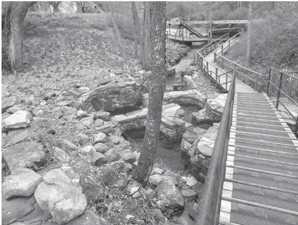
Completed restoration by the footbridge, 2016.