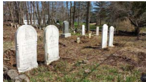
Blackstone-Flagg Cemetery (GR-69) - before, during and after repair & cleaning