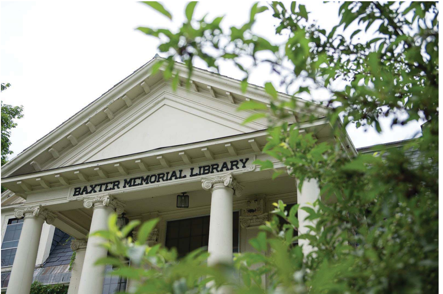
Baxter Memorial Library Building