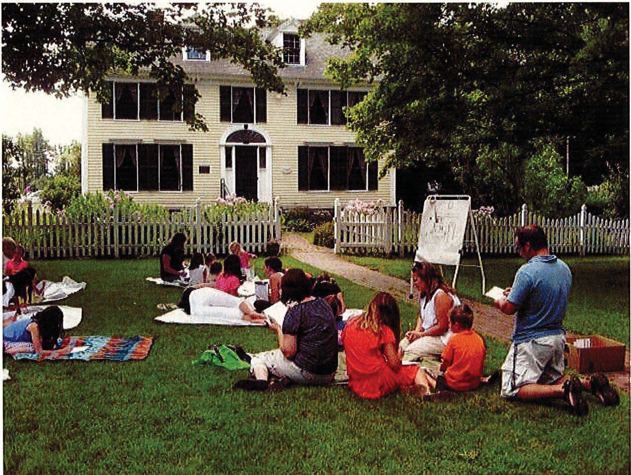
Baxter Museum and Grounds Baxter Memorial Library's "Painting in the Park Series"