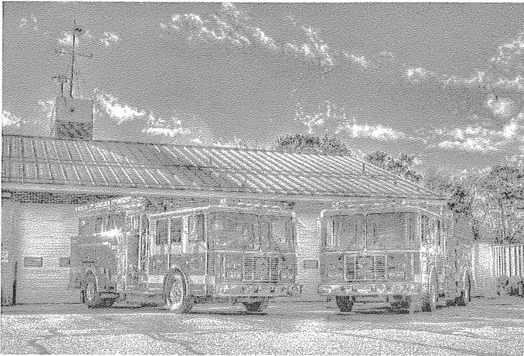
Gorham Fire Department's Engine 6 and 2