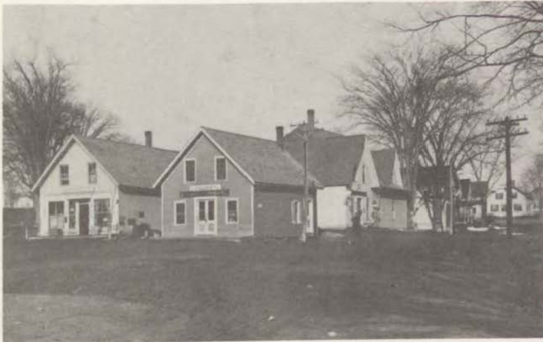
CARMEL VILLAGE SQUARE 1918-1920