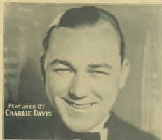
FEATURED BY CHARLIE DAVIS