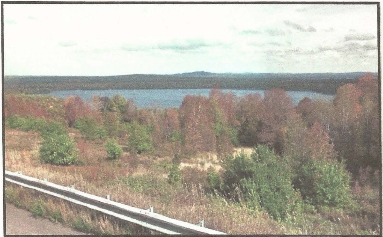
Overlooking Longfellow (Deering) Lake

Annual Report for Year Ending June 30, 2018