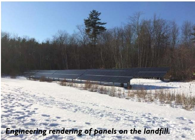
Engineering rendering of panels on the landfill.

cost of about $47k. New, the system is $79,397. Once the cost of the system is paid for, the Town's