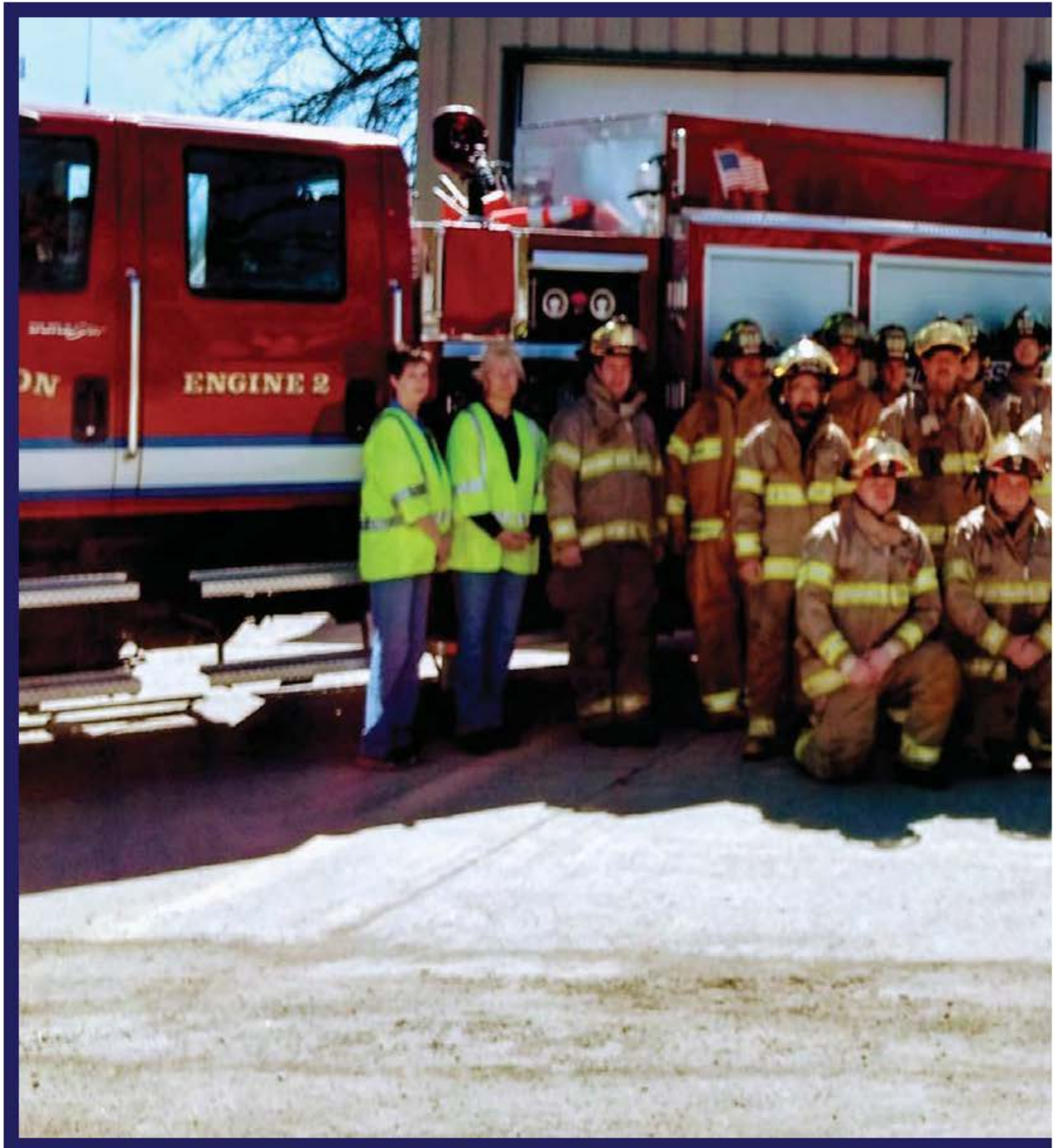
Mandatory Safety Training Day