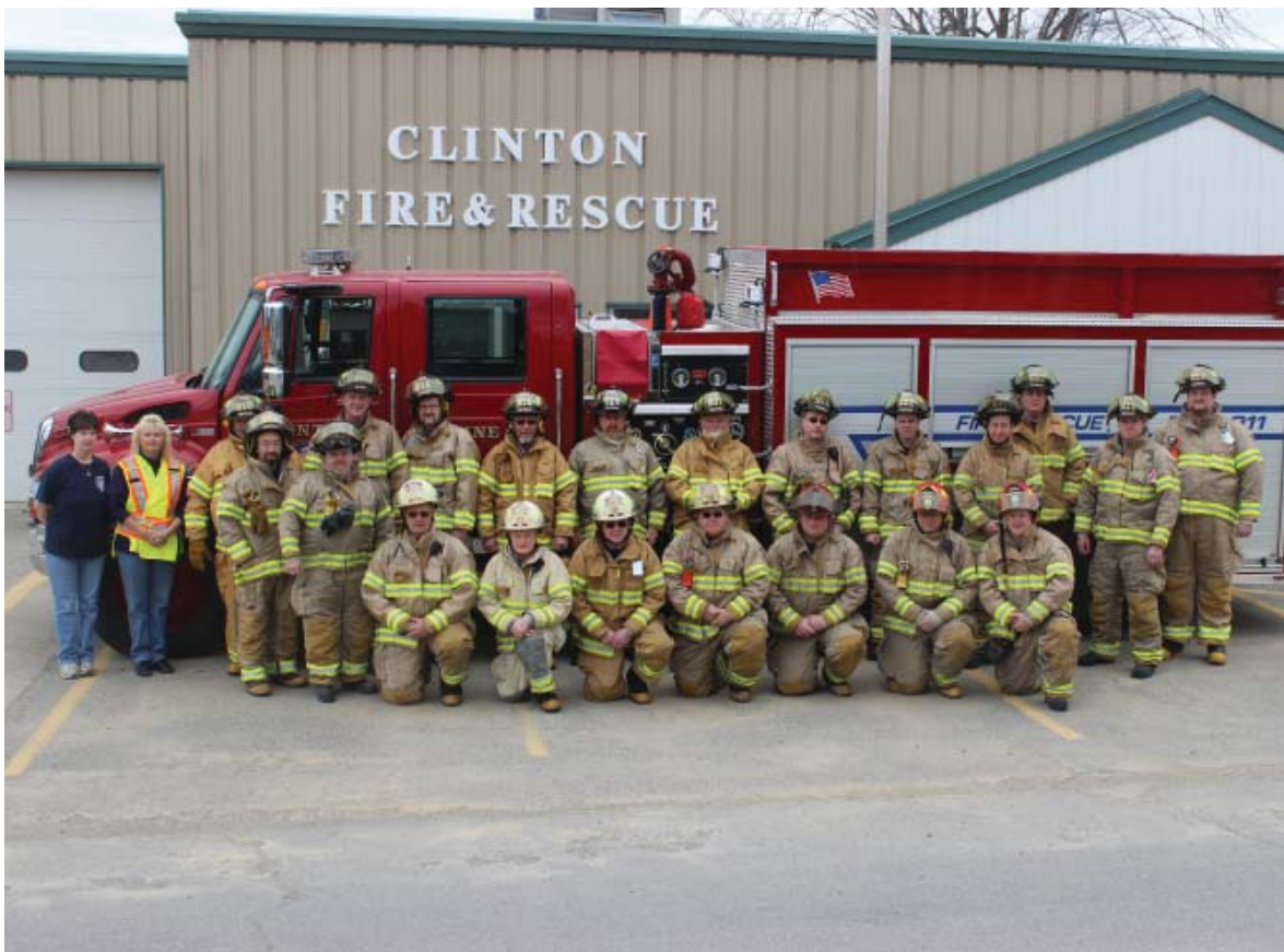
2012 Fire Truck & Crew