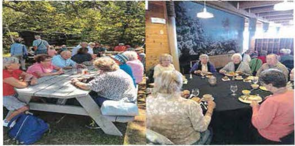
Seniors at Cabbage Island

Senior citizens continue to participate in numerous programs. Trips were taken to Fryeburg Fair, Sugarloaf Mountain foliage trip, a holiday trip to Portland for the Magic of Christmas, Home Garden Flower Show, Cabbage Island, Maine State Music Theatre in Brunswick, luncheons at the Lake Region Vocational Center. Programs offered to seniors include: swimming, tennis, golf, Zumba, flu and blood pressure clinics, and walking groups. Every Monday and Thursday at the Central Fire Station seniors got together and played bingo, cribbage, games and finished up the morning with a fantastic lunch.