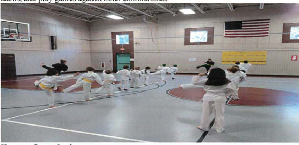
Karate at Songo Locks

Soccer combined with Naples to kick off the fall season, with 5 first grade teams, 5 2<sup>nd</sup> and 3<sup>rd</sup> grade teams and 5 4<sup>th</sup>-6<sup>th</sup> grade teams. 45 kindergarteners showed off their skills on Monday afternoons. Karate classes were held once a week at Songo Locks School, where children learned traditional martial arts, and much more. Field hockey was offered to children in grades 2 through 6. This program gives participants the opportunity to learn a new sport, develop skills, interact with Lake Region High School and Middle School teams, and play games against other communities.