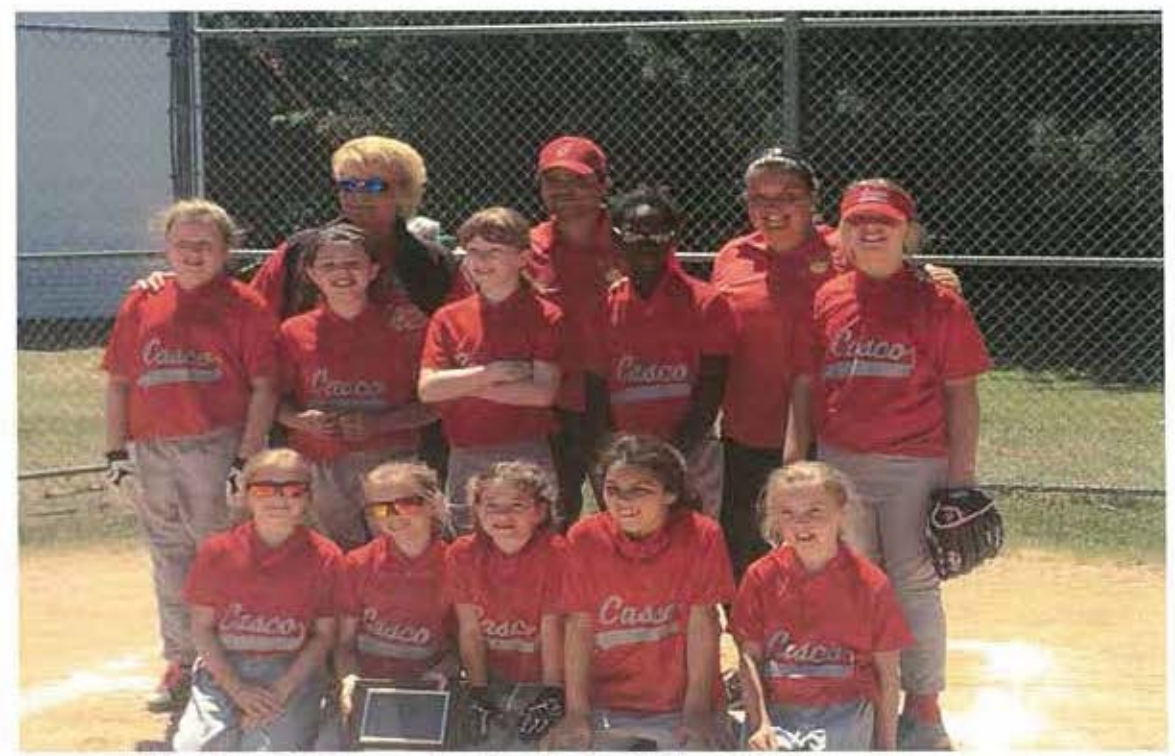
Casco 10& under softball were the 2016 Softball Champions!

Youth golf lessons were offered at Point Sebago Resort for juniors on Saturday mornings and for adults on Wednesdays. Unfortunately we did not have enough adults to run the program, but we hope to next year.