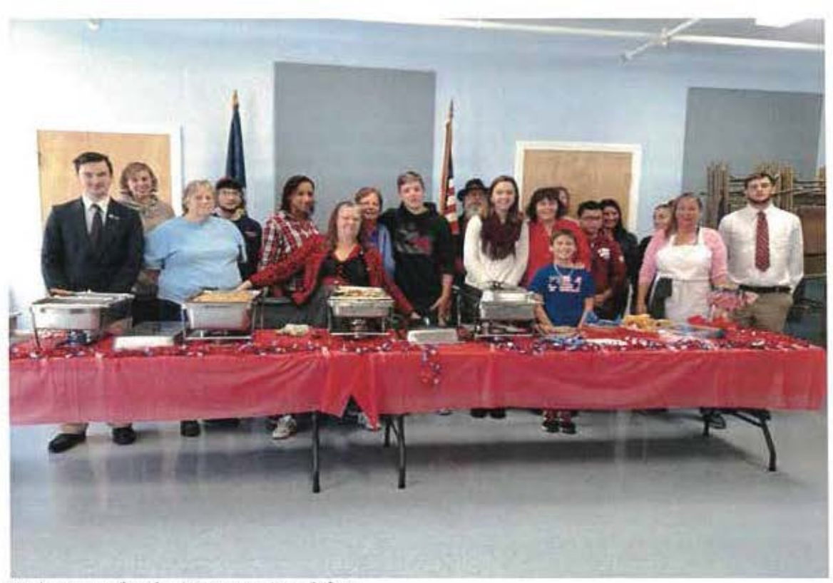
Volunteers for the Veterans Breakfast

Senior citizens continue to participate in numerous programs. Trips were taken to Fryeburg Fair, Sugarloaf Mountain foliage trip, a holiday trip to Portland for the Magic of Christmas, Home Garden Flower Show, Cabbage Island, Maine State Music Theatre in Brunswick, luncheons at the Lake Region Vocational Center. Programs offered to seniors include: swimming, tennis, golf, Zumba, flu and blood pressure clinics, and walking groups. Every Monday and Thursday at the Central Fire Station seniors got together and played bingo, cribbage, games and finished up the morning with a fantastic lunch.