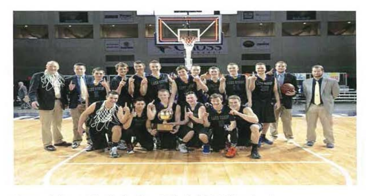
Congratulations to Lake Region Boys Basketball 2016 Champions!!

Over one hundred families anxiously awaited the arrival of Mr. & Mrs. Claus to celebrate the holiday season on the Village Green last December. It was great to see the community gather together, sing holiday songs to music provided by Lake Region Band, watch a performance by Mayberry Hill Pre-School children, sip on hot chocolate, decorate cookies and create their own ornaments.