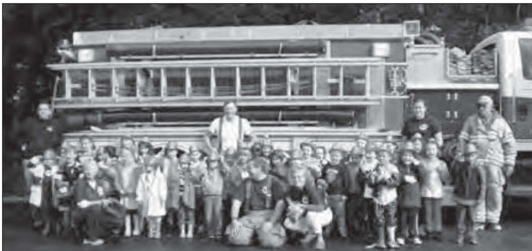
Bristol Fire and Rescue provides annual safety training for students at the Bristol Consolidated School.