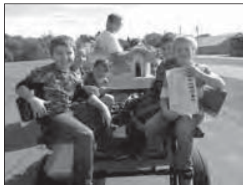
In September, Grade 2 Bristol students attended the Conservation Fair in Union.

We greatly appreciate your continued support of our PreK – grade 12 learners. Thank you.