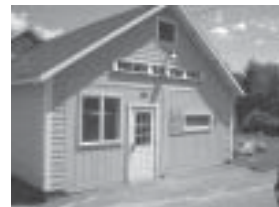
Bremen Fire Dept.