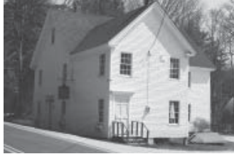
Bremen Town House