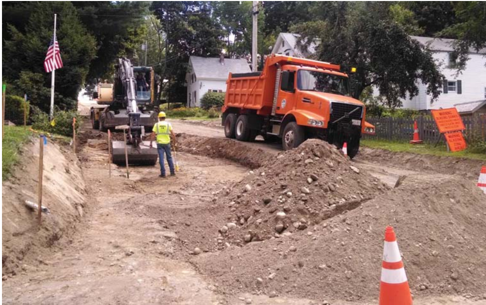
School Street Construction during the summer of 2015.

The Engineering Bureau provides engineering services for the benefit of the residents and business owners in the City of Augusta. It provides design and management services for a variety of City projects and plays a large role in the evaluation and approval of other private development projects which are being planned within the City. The Engineering Bureau is staffed by the City Engineer.