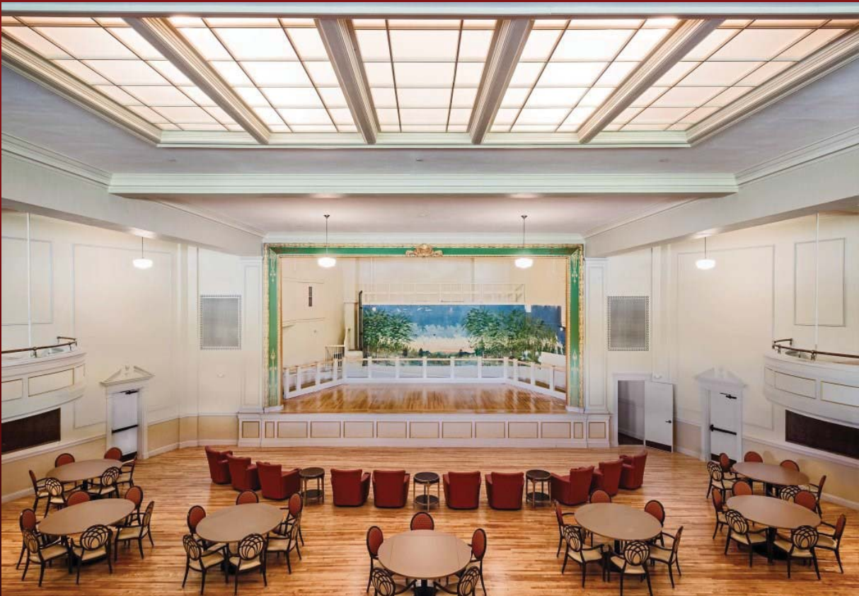
Pictured: The Coney Flatiron Building post renovation. Top: Outside looking at the new main entrance and the beautifully restored auditorium.