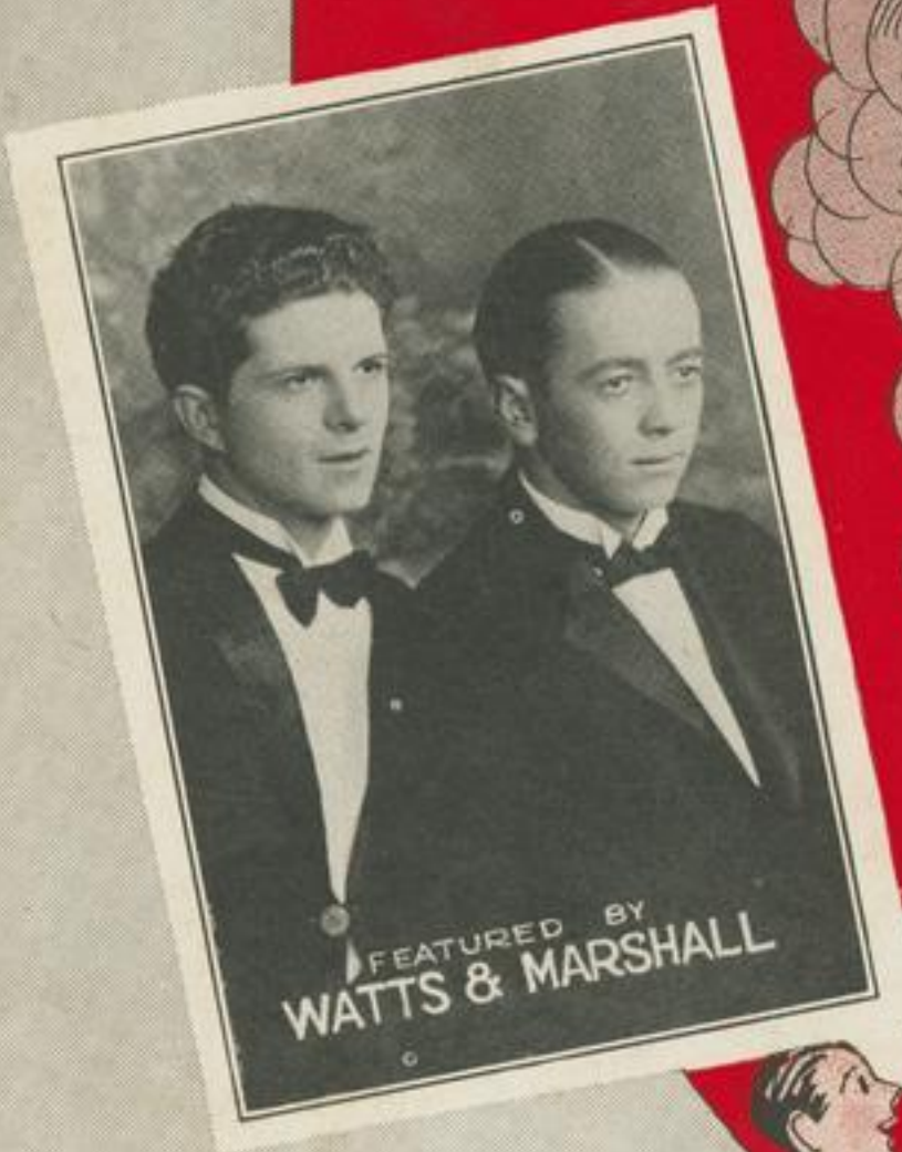
FEATURED BY WATTS & MARSHALL