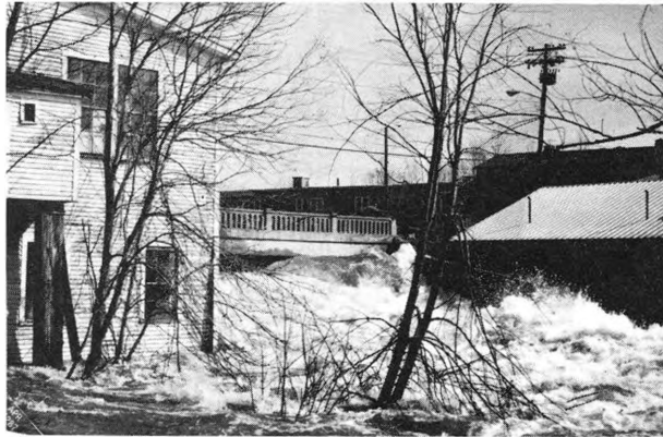
Grain building and Main Street Bridge