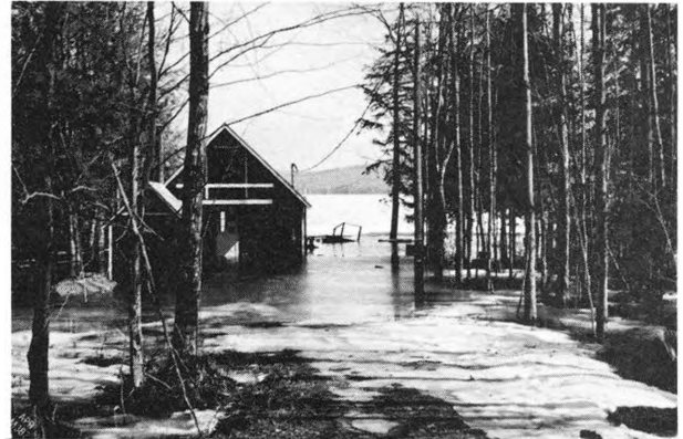
Great Moose Lake Camp