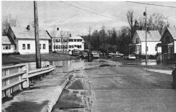
North Street by Humphrey's