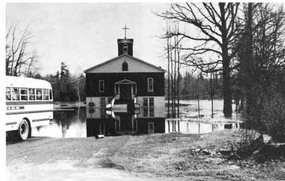
Hartland Full Gospel Church