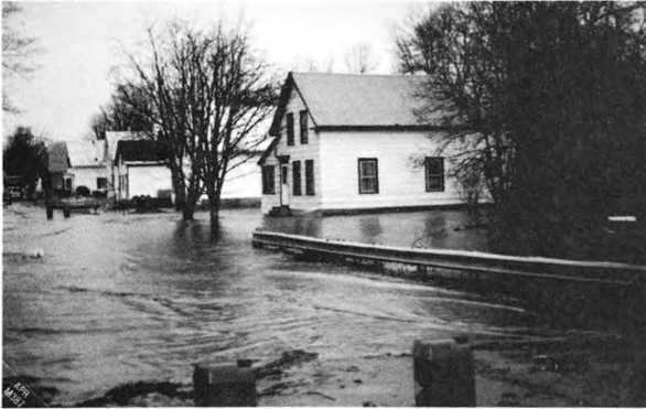
Water Street, Merlene Mead residence