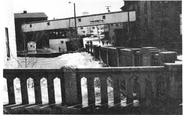
Main Street Bridge