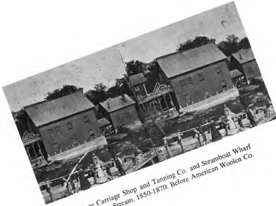
Page Carriage Shop and Tanning Co. and Steamboat Wharf across the Stream. 1850-1870. Before American Woolen Co.