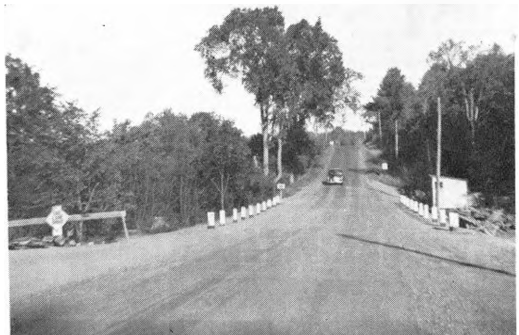
Corsons Corner Bridge

Prepared by Municipal Officers Hartland, Maine