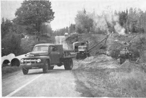
Construction Route 23