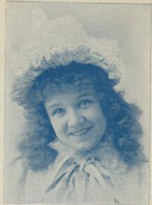
Now being Sung by the Queen of Ideal Soubrettes LOTTIE WILLIAMS