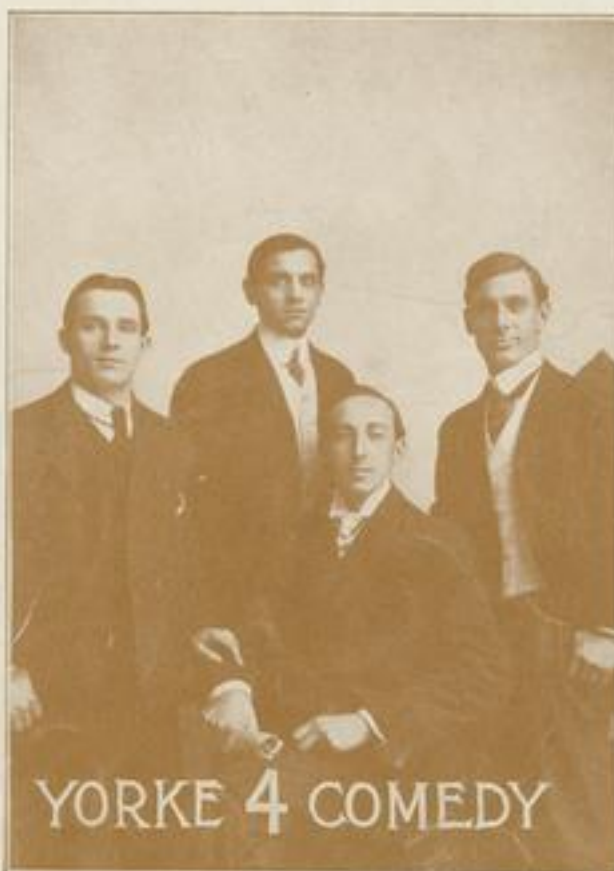
YORKE 4 COMEDY