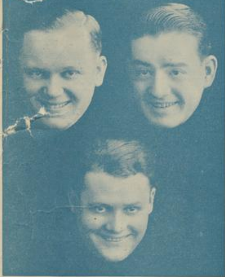
PARK ROME AND FRANCIS.