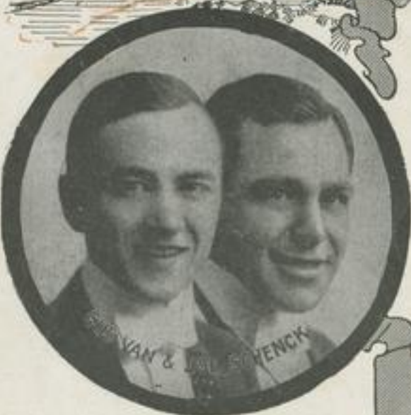
VAN & SCHENCK

ON SALE AT EVERY MUSIC COUNTER—ASK THE PIANIST TO PLAY THEM