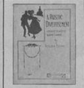
Characteristic Barn Dance by ATELIER BEDOIS

These Numbers Are Exceptionally Melodious and Highly Recommended for Teaching Purposes.