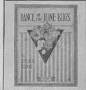
A bright, and lively, characteristic instrumental number of decided beauty, by ATELIER BEDOIS