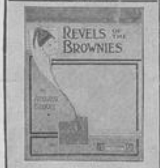
A charming, light Dance number written by the composer's lightest style, by ATELIER BEDOIS