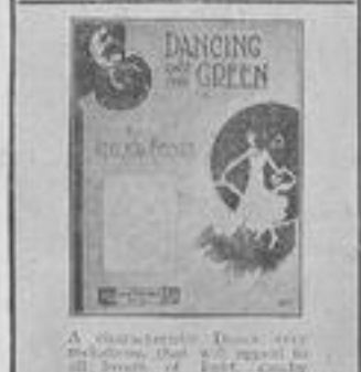
A characteristic Dance, very melodious, that will appeal to all lovers of light, catchy numbers, by ATELIER BEDOIS