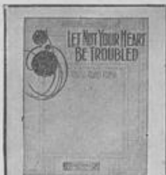
A beautiful Song by CARO ROMA