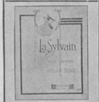
A beautiful Piece Composed by ATELIER BEDOIS