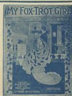
Greatest Song Hit of the Season

Complete Copies on Sale Wherever Music is Sold!