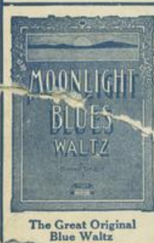
The Great Original Blue Waltz