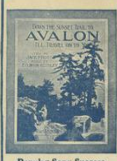
Popular Song Success