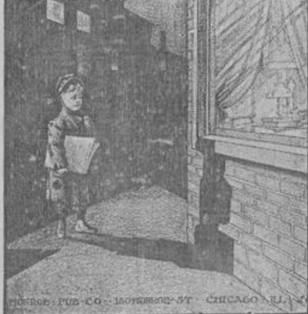
CHICAGO PUB. CO. 1409 BROADWAY ST. CHICAGO, ILL.