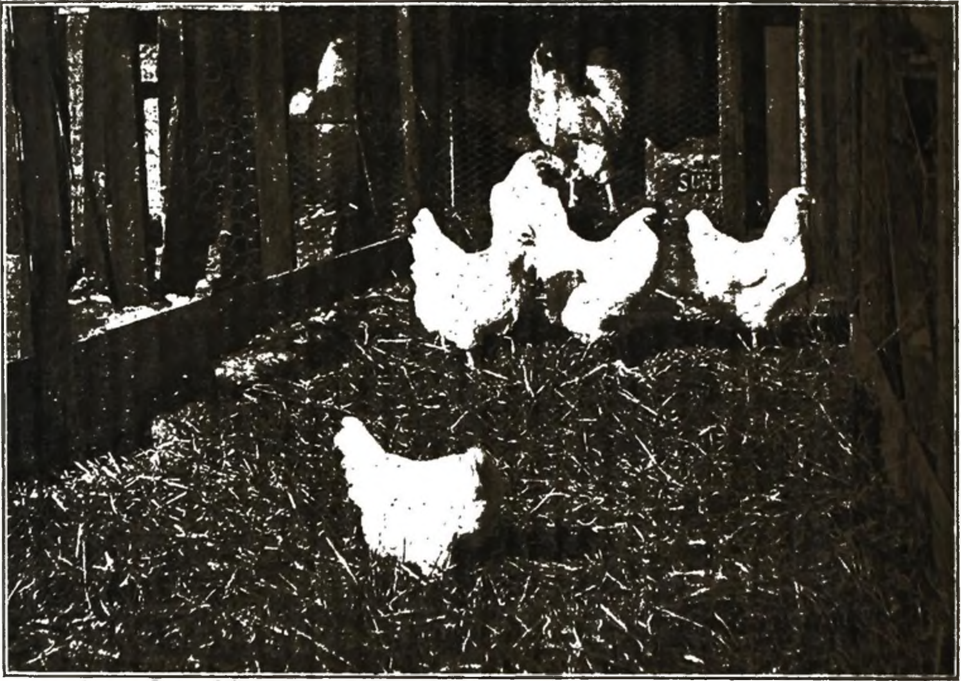
First Pen at Bangor Poultry Show, December, 1911