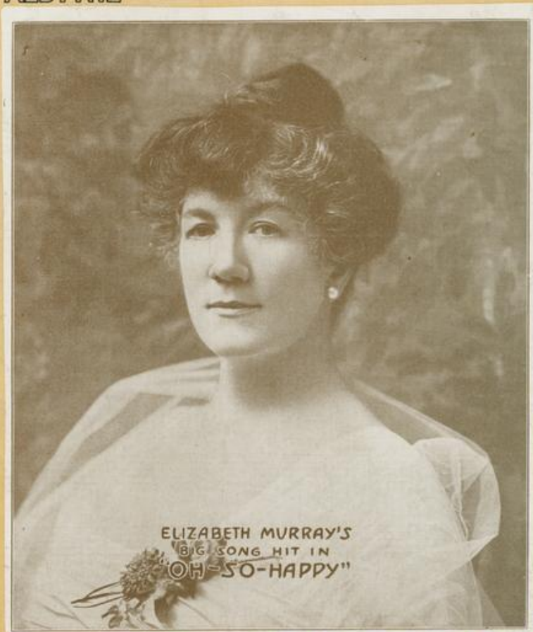
ELIZABETH MURRAY'S BIG SONG HIT IN "OH-SO-HAPPY"