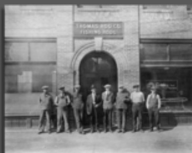
Thomas Rod Co., 1935