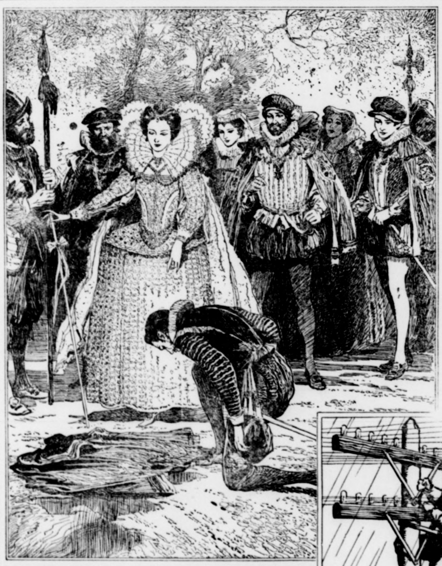
Typical of the spirit of service among telephone personnel.

Nominations are made by the Student Senate and the Women's Student Government Association. Voting is limited to the three upper classes and at least 50% of the student body must cast ballots in order to make the election valid.