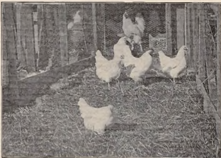
One of Our Prize Winning Pens