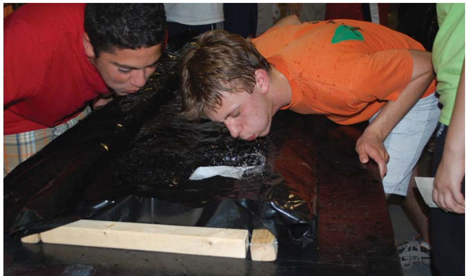
Consider Engineering participants are shown racing boats they have constructed out of 1 sheet of paper and one paperclip. The challenge is to construct a boat that will travel the length of the pond, powered by breath in the shortest time.

The dates for Consider Engineering 2011 will be July 10-13; July 17-20 and July 24-27. Applications are available on the Foundation's website at www.maineulpaper.org or by calling the Foundation office at (207) 581-2297