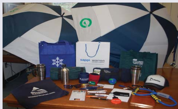
Before first year scholarship recipients left the scholarship banquet they were presented with "Welcome Bags" filled with donated "logo" items from Foundation Company Members.

For several years incoming first year scholarship recipients have been presented a "Welcome Bag" of "Logo" items from Foundation Company Members. The bags are used to introduce our students to the companies that support them as Foundation scholarship recipients.