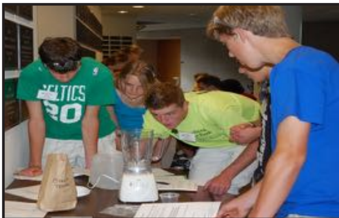
Consider Engineering participants compete to make a piece of paper to meet assigned specifications.