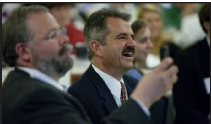
A light moment during the banquet.