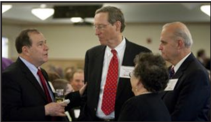
Discussing a new Pulp & Paper Foundation Scholarship.