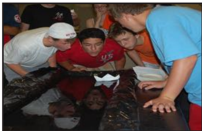
Consider Engineering participants are shown racing boats constructed out of one sheet of paper and one paperclip.