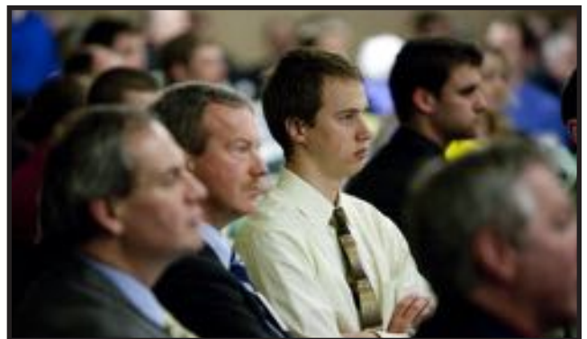
Listening intently during an engineering presentation.