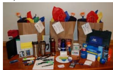
Foundation company members donated logo items to go into gift bags for incoming first year students.

Before leaving the students were each presented with a "gift bag" filled with goodies from Foundation company members. Companies participated by donating items the students would find useful with their company logo on them. Companies making donations were Buckman, Cianbro, Dow Chemical, Fraser Papers, GAC Chemical, Madison Paper, Metso Paper, Mohawk Paper, Newpage Corporation, Procter & Gamble, Safe Handling, Sappi Fine Paper, SCA Americas, and Verso Paper. This is the second year we have distributed gift bags to incoming first year students.