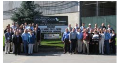
Attendees at Pulp & Paper Foundation Membership Committee meeting and luncheon held at Verso Paper, Jay, ME.

At the heart of Woodard & Curran are its talented people whose commitment and integrity drive results for clients everyday.