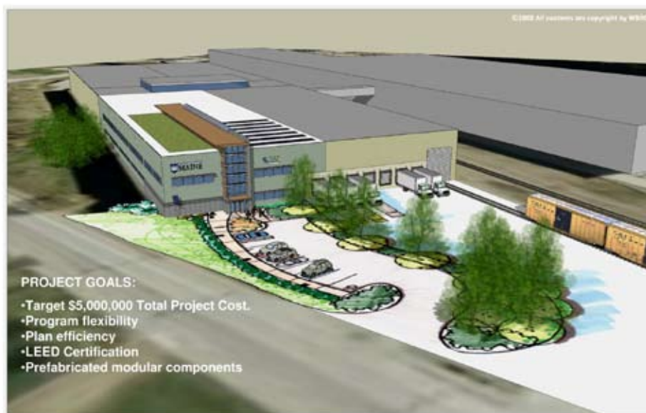
Architectural drawing of New FBRI Technology Center.