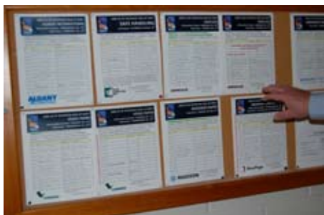
Co-Op/Intern Interview Sign-Up Bulletin Board.