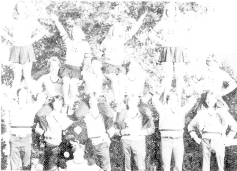
Miss X in happier days

Miss X is now at another university, majoring in fashion design. But her shattered past still pursues her. "There's are nights when I dream of myself shouting 'UMO, UMO' into a megaphone, but there's no one in the stadium."