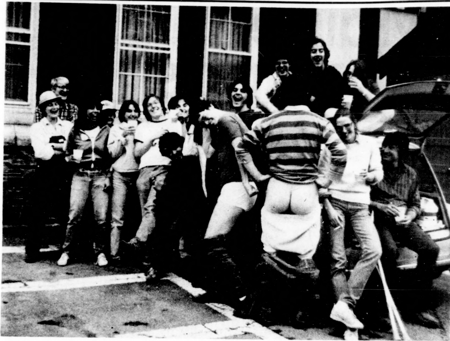
The Maine Compost staff wishes everyone a happy summer.