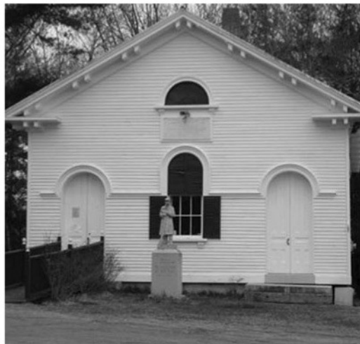
Vienna Town House - Rte. 41, Vienna, ME

1st & 3rd Tuesdays of every month 6:30 p.m. at the Town House