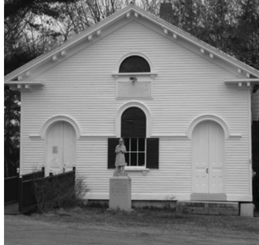
Vienna Town House - Rte. 41, Vienna, ME

1st & 3rd Tuesdays of every month 6:30 p.m. at the Town House