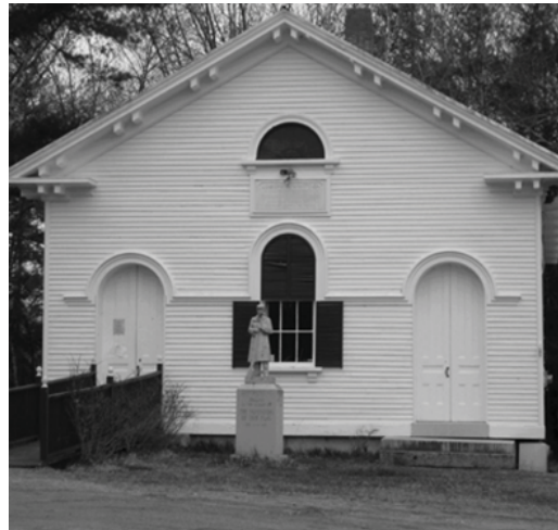
Vienna Town House - Rte. 41, Vienna, ME

1st & 3rd Tuesdays of every month 6:30 p.m. at the Town House