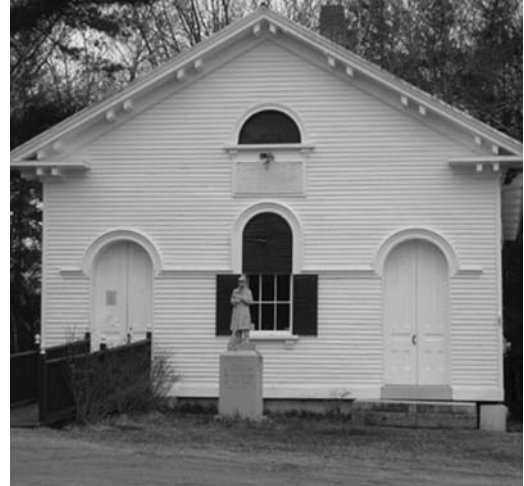
Vienna Town House - Rte. 41, Vienna, ME

1st & 3rd Tuesdays of every month 6:00 p.m. at the Town House