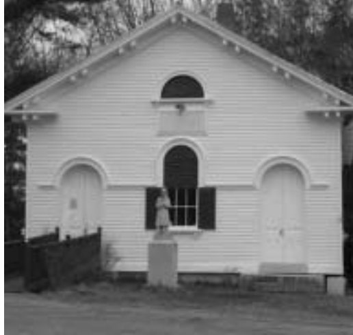
Vienna Town House - Rte. 41, Vienna, ME

1st & 3rd Tuesdays of every month 6:00 p.m. at the Town House