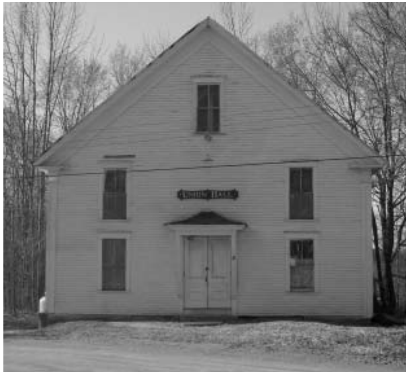
Vienna Union Hall

The good news is, we do have insurance, the damage will be repaired and the hall will be back better than ever, hopefully by the end of October.