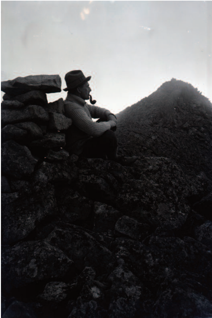
“The Old Man of Katahdin,” photograph of unknown man (possibly Maine guide Leroy Dudley) sitting on Mount Katahdin. Bert Call Collection . Image courtesy of Special Collections, Raymond H. Fogler Library, DigitalCommons@UMaine, http://digitalcommons.library.umaine.edu/bert_call/27/ , accessed 11 December 2017.